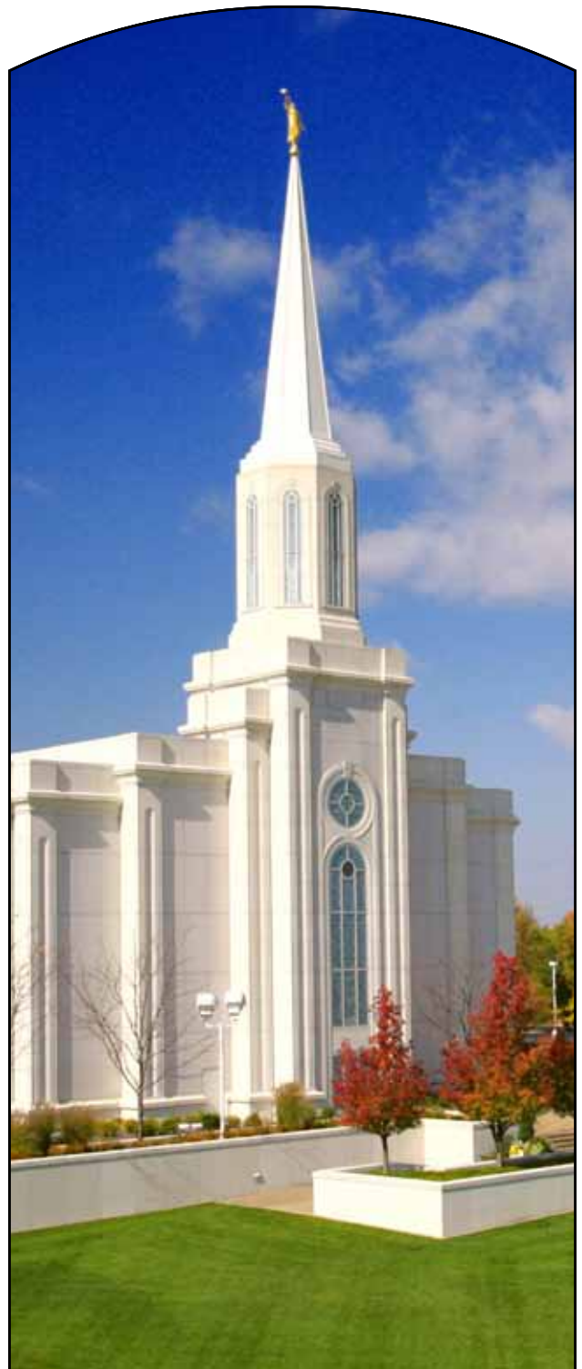
St. Louis Missouri Temple